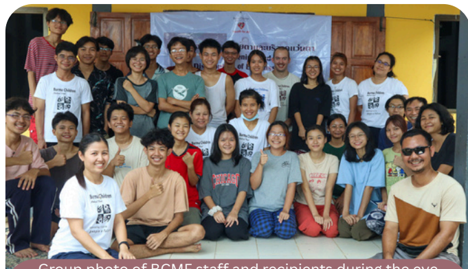
Group photo of BCMF staff and recipients during the eye screening mission at Mae Kasa Church, Mae Sot District, Tak Province, Thailand, on 10 May 2024.

BCMF began its eye screening project in 2015 and has since provided free eye screening services to marginalised communities in Burma and Thailand. The team travels to remote and underserved areas in both countries, offering services to individuals who may be living with undiagnosed vision issues or unable to access specialised eye care due to financial, legal or geographical barriers.